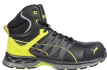
VELOCITY 2.0 YELLOW MID 633880