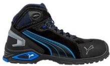
RIO BLACK MID 632250