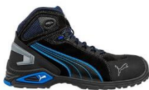
RIO BLACK MID 632250