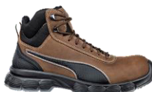
CONDOR BROWN MID 630122