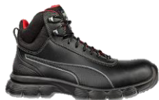
CONDOR BLACK MID 630101