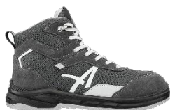
AXIS GREY MID 637330