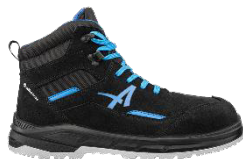
VECTOR BLUE MID 637320