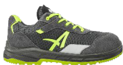
AXIS GREEN LOW 647350