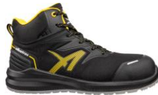
DALTON BLK/YELLOW MID 638810